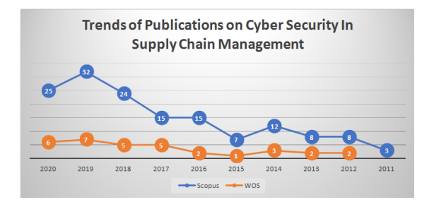
Fig. 2. Trend of Publications

The present study shows an overview of 41 articles that met the criteria set by the researchers for the purpose of the systematic review.