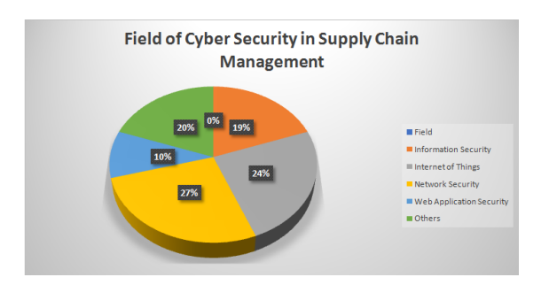
Fig. 3. Field of Study

security in the context of supply chain management (Refer Figure 3). When most companies and businesses think about security, they often think about securing their digital networks, software, and assets from cyber attacks and data breaches. But, for the supply chains of whether traditional manufacturers or service providers, or data supply chains trusted by most large companies, they are also vulnerable to security risks. This is seen in many big data breaches through third parties. In practice, every company or business has a place in the supply chain, where the supply chain continues to grow on the flow of information such as the flow of goods and services. Therefore, it is not surprising that supply chain security is a very complex and continuously evolving function. Next, this shows that business executives pay more attention as the risks faced by information across the supply chain become increasingly apparent.