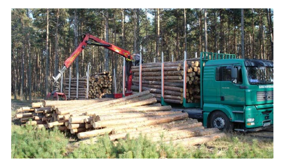
Fig. 1. Handling of timber at the wood road Rys. 1. Manipulowanie drewnem na drodze leśnej

of special equipment for the handling and transportation of round wood, for instance lorries with integrated cranes and adapted under-carriages.