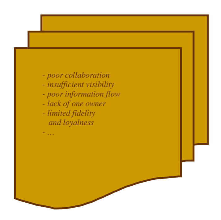
Fig. 2. Sources of limitations in supply chain risk management Rys. 2. Źródła ograniczeń w zarządzaniu ryzykiem w obrębie łańcucha dostaw

There is no much practical experience in supply chain management itself, even less with the supply chain risk management so far, but strong belief exists, that the positive influence of risk management onto supply chain performance - including its competitiveness - makes it a business imperative of growing importance nowadays.