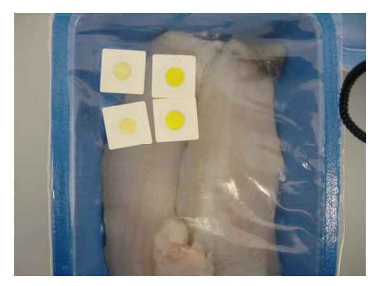
Fig. 4. Smart packaging sample Rys. 4. Przykłady inteligentnych opakowań

The future integration of gas indicators into RFID tags or barcode labels; willenable gas indicator signals to be transmitted also electronically not only visually, is expected. Advances in printing and smart ink technology will also allow gas indicators to be read automatically from a distance using optical systems.