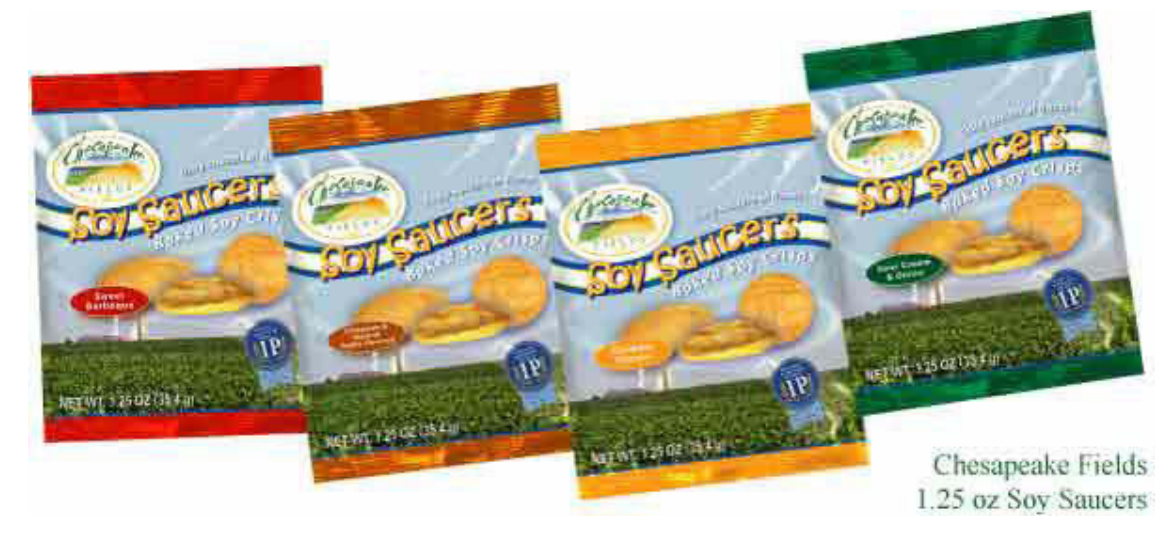
Fig. 2. Food packaging today Rys. 2. Pakowanie żywności w dzisiejszych czasach

Smart packaging is being developed through the application of nano-sensors able to detect the release of particular chemicals. The packaging can be engineered to change colour to warn the consumer about food spoilage or contamination by pathogens. Electronic 'tongues' and 'noses' will be designed to mimic human sensory capacities, enabling them to 'taste' or 'smell'. Smart packaging can be considered an all-embracing term used to encompass both intelligent and active packaging, in addition to this packaging design functional and emotional packaging.