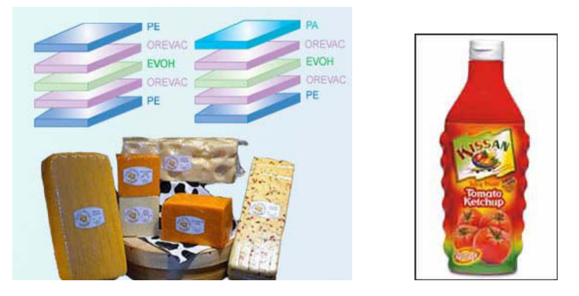
Fig. 3. Ethylene-vinyl alcohol copolymer (EVOH) used in shrinkable films and plastic containers Rys. 3. Zastosowania kopolimeru EVOH w kurczliwych foliach i opakowaniach plastikowych