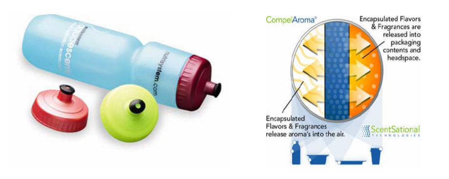
Fig. 5. NutriSystem'sAquaescentswater bottle uses an aroma-enhanced cap to provide noncaloricflavor to plain drinking water

displays a clear visual signal. This system is planned for detecting gross contamination, because it is not sensitive enough for detecting very low levels of pathogens that can cause disease.