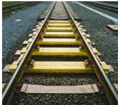
Fig. 2. The platform scales (top left), in the foundation tank (top right) and in the rail beams (bottom) Rys. 2. Wagi kalejowe pomostowe (u góry z lewej), w wannie fundamentowej (u góry z prawej) i w r